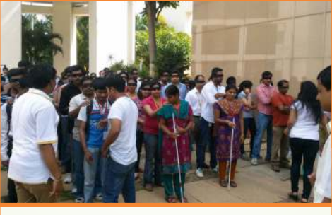
Dakshin Karnatak Blind Fold Walk