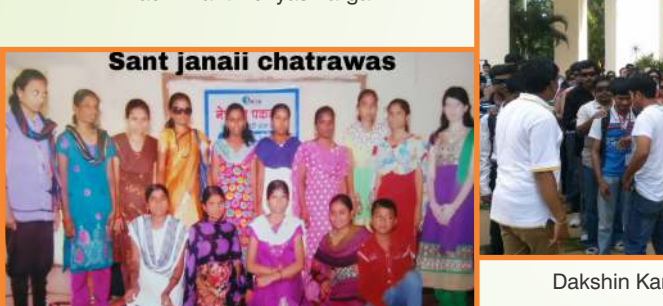
Devgiri Nanded Hostel for VC Girls