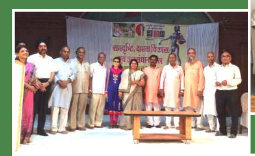
Haryana Madhav Netra Bank, Karnal