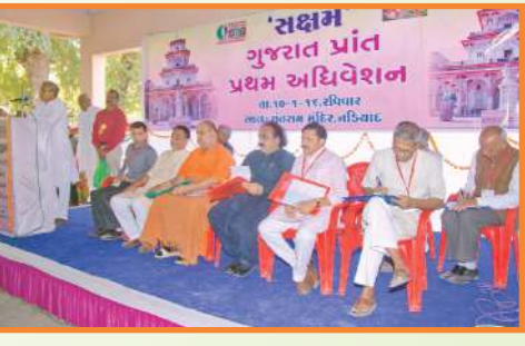
Gujarat State Conference