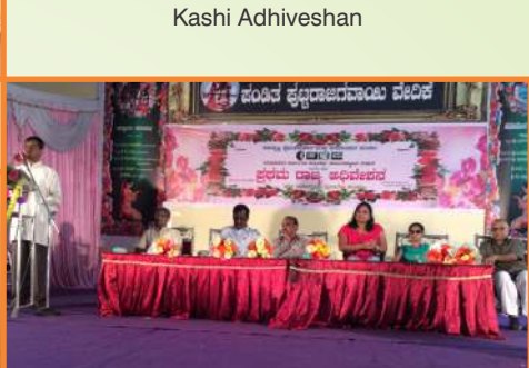
Dakshin Karnatak State Conference