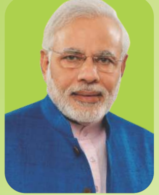
Shri Narendra Modi

Cornea Andhatv Mukt Bharat Abhiyan (Corneal Blindness Free Bharat Movement)