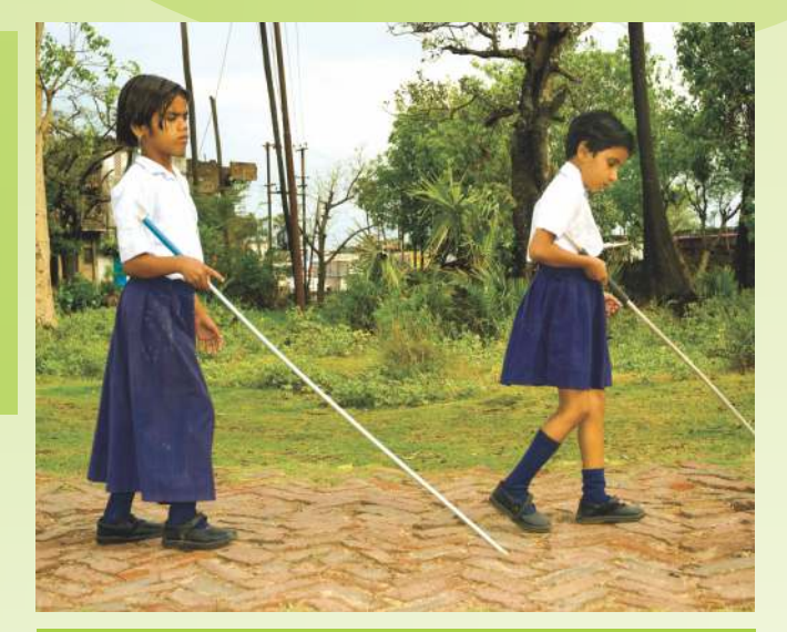
69% of blind children drop out of schools

"Jeethe Jeethe Raktadaan Jaathe Jaathe Netradaan"