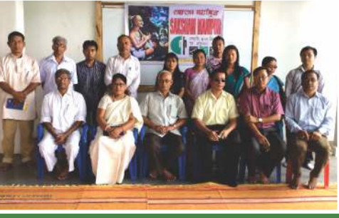
Manipur, Committee Formation